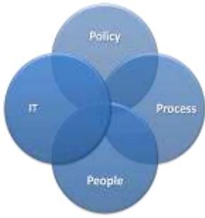
Figure 1- Interrelationship of Basic Business Zones

Credentialing providers is absolutely essential to being a good steward of coverage and care. Many tragic stories underscore the need for primary source verification of education, licensure, insurance, and other credentials. One payer failed to comprehensively validate its providers' credentials only to discover that children in one particular treatment program were camping with provider staff and exchanging their medication for staff favors.